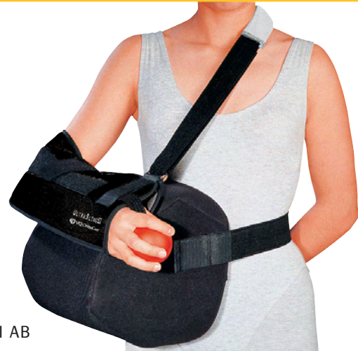
UltraSling® II AB